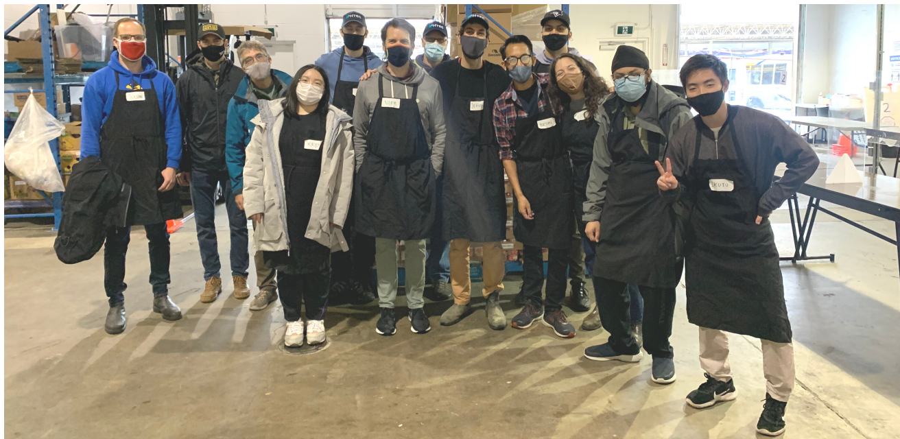
HTEC Hydrogen Technology & Energy Corporation - Volunteering at the Vancouver distribution site