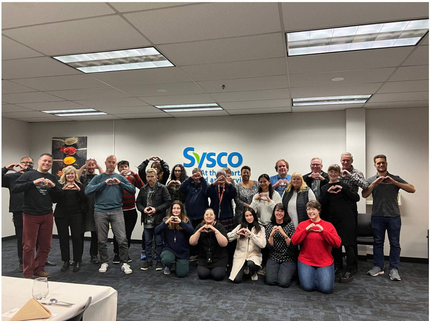
Volunteers and Sysco staff photo

Last month 40 volunteers were invited to an appreciation lunch at Sysco Vancouver. Sysco generously hosted the event and served a three-course meal as part of their 2nd annual Purpose Month. Sysco's Purpose month was established to give back across Canada. In addition to volunteering and celebrating our hardworking volunteers, they also help us deliver food for free! Picking up food from the GVFB in Burnaby has enabled the GVFB to deliver more than 50,000 LB of fresh food to the Lake Country and Nicola Valley Food Banks.